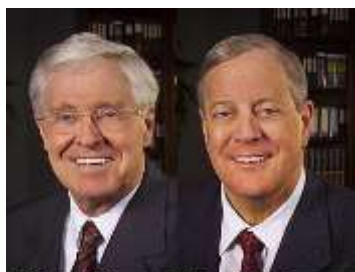
The Koch Brothers Charles and David

However, an audit trail reveals that Donors is being indirectly supported by the American billionaire Charles Koch who, with his brother David, jointly owns a majority stake in Koch Industries, a large oil, gas and chemical conglomerate based in Kansas.